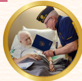
LAST PATROL VOLUNTEER READS A CONGRESSIONAL LETTER TO A VETERAN IN HOSPICE.

OUR MISSION IS PROVIDING FRIENDSHIP, HONOR, AND SUPPORT FOR VETERANS ON THEIR LAST PATROL. YOU CAN HELP US SUPPORT THESE SPECIAL VETERANS AND CELEBRATE THEIR SERVICE BY ATTENDING OUR 4TH ANNUAL VETERAN'S LAST PATROL DINNER. SPONSORSHIPS ARE AVAILABLE AND THE DINNER WILL INCLUDE A SILENT AUCTION.